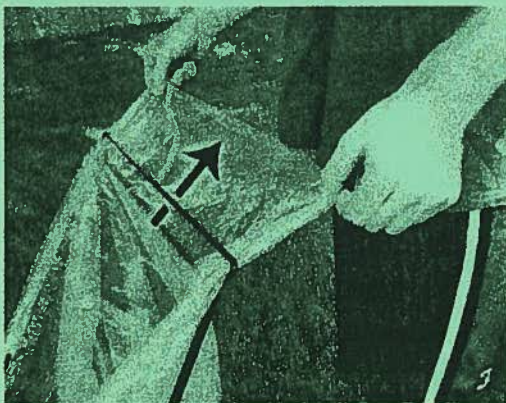
1. Through the Loop...

When properly secured, the bag will look like the picture above, and will be locked in place until it is time to remove. Stand facing one of the frame's Secure Bag Locks (one of the loops). Place one foot on the bottom rung to stabilize the frame.