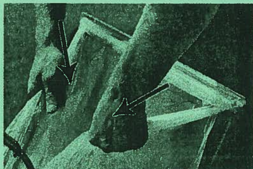
3. Pull the Bag Tight!

1 Open bag and place inside frame. Using two hands pull approximately 6 inches of bag through the loop as shown.